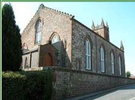
Lochmaben Parish Church

The southern end of Lochmaben wraps around the northern end of Castle Loch. Here you find many of the town's leisure facilities including sailing, tennis and bowls clubs.