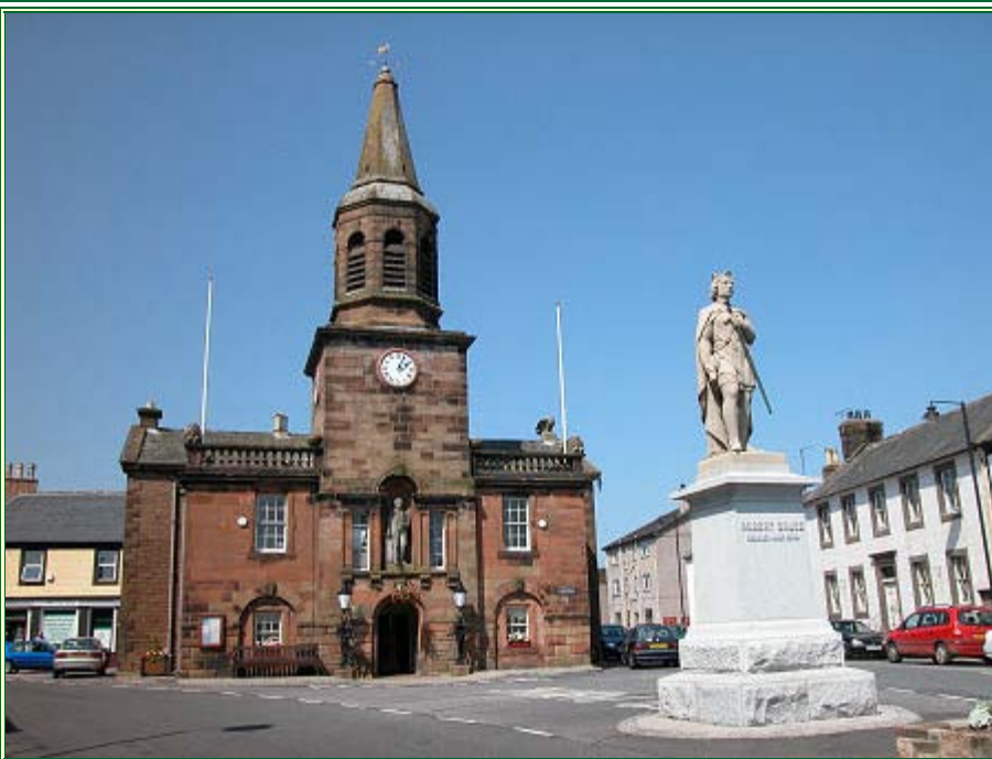
Town Hall and Robert the Bruce