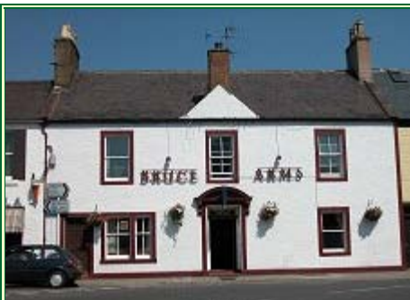
The Bruce Arms