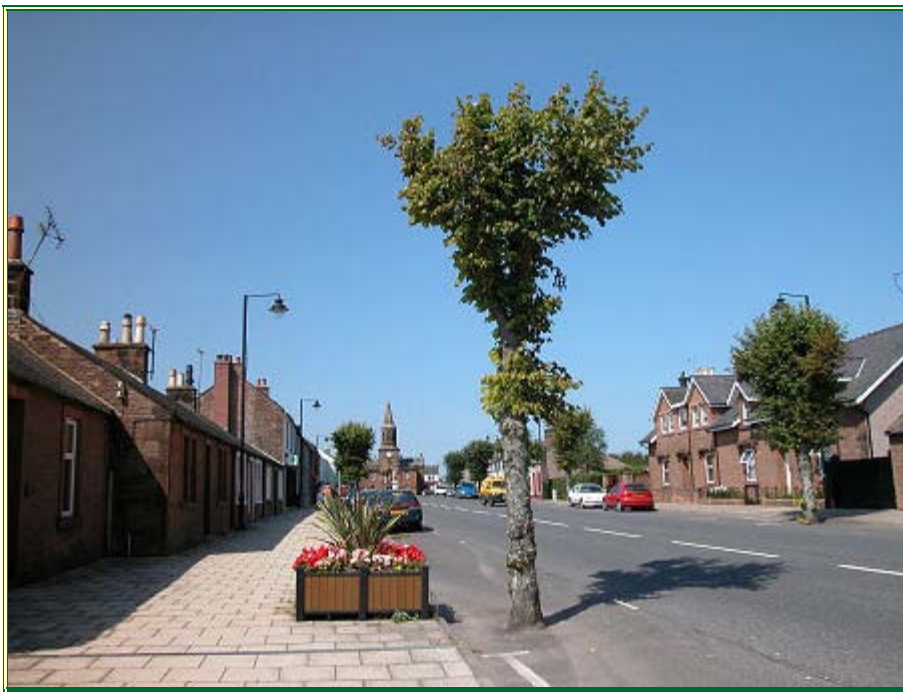
Lochmaben High Street

Ancestry.com Family Tree Free family tree. Discover Hotels Scottish Borders All hotels shown on a regional map Search For Your Family Find & Contact Your Family Free Family Tree Search Just Enter Your Name &