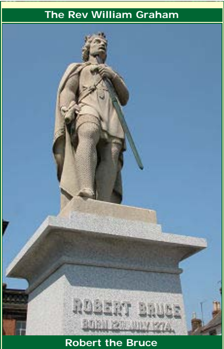
Robert the Bruce

Lochmaben's fortunes have varied over the last 900 years. In 1827 it was described as the poorest Royal Burgh in Southern Scotland. In 1863 a station opened in Lochmaben on the branch railway from Lockerbie to Dumfries , now long closed. The textiles industry came to the area in the 1800s before diminishing in importance. In more recent years a large cheese processing plant has brought significant employment to the area.