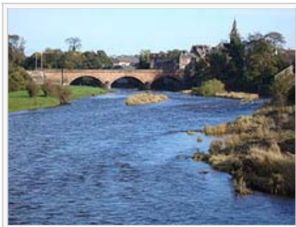
Annan River road bridge

Annan stands on the River Annan nearly 2 miles from its mouth, 15 miles from Dumfries , in the region of Dumfries and Galloway on the Solway Firth in the south of Scotland . Eastriggs is about 3 miles to the east