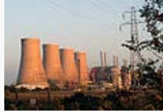
Chapelcross power station (now partially demolished)