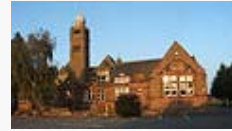
Annan Academy (old buildings)