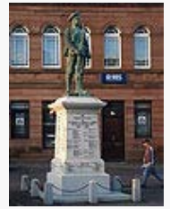
War memorial, High Street