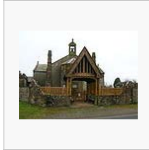
The parish church and lychgate .