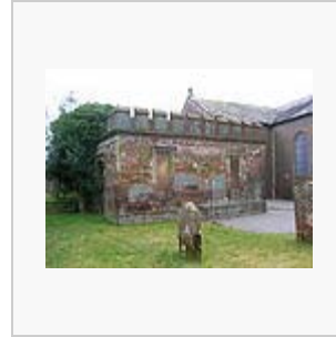
The Douglas family Mausoleum at the Parish Church.