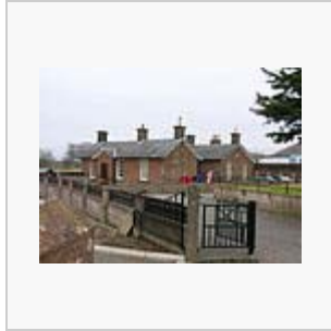
The old Cummertrees railway station .