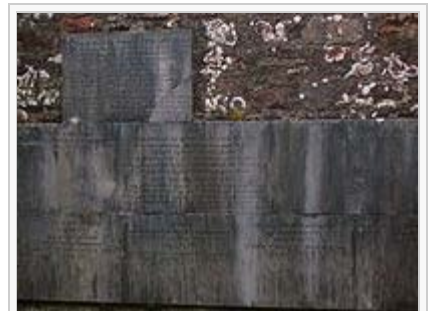
Memorial to Lord Francis Douglas in Cummertrees Parish Church.